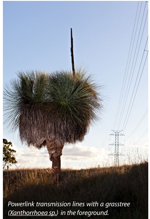
Powerlink transmission lines with a grasstree ( Xanthorrhoea sp.) in the foreground.