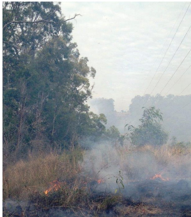
Planned burn within the vicinity of powerlines, The Gap, Qld.

The Energy Networks Association 2 , in consultation with emergency services groups across Australia, has produced National Guidelines on Electrical Safety for Emergency Personnel . Powerlink endorses the use of these guidelines. The guidelines provide critical information relating specifically to fire control near high voltage powerlines, including the special conditions that apply to the use of water in fire control activities near powerlines. An extract from the National Guidelines on Electrical Safety for Emergency Personnel follows. A full version of the guidelines can be purchased from www.saiglobal.com or by calling 131242. If you are involved in fire management or control near high voltage powerlines, please familiarise yourself with these guidelines and the recommended control measures.