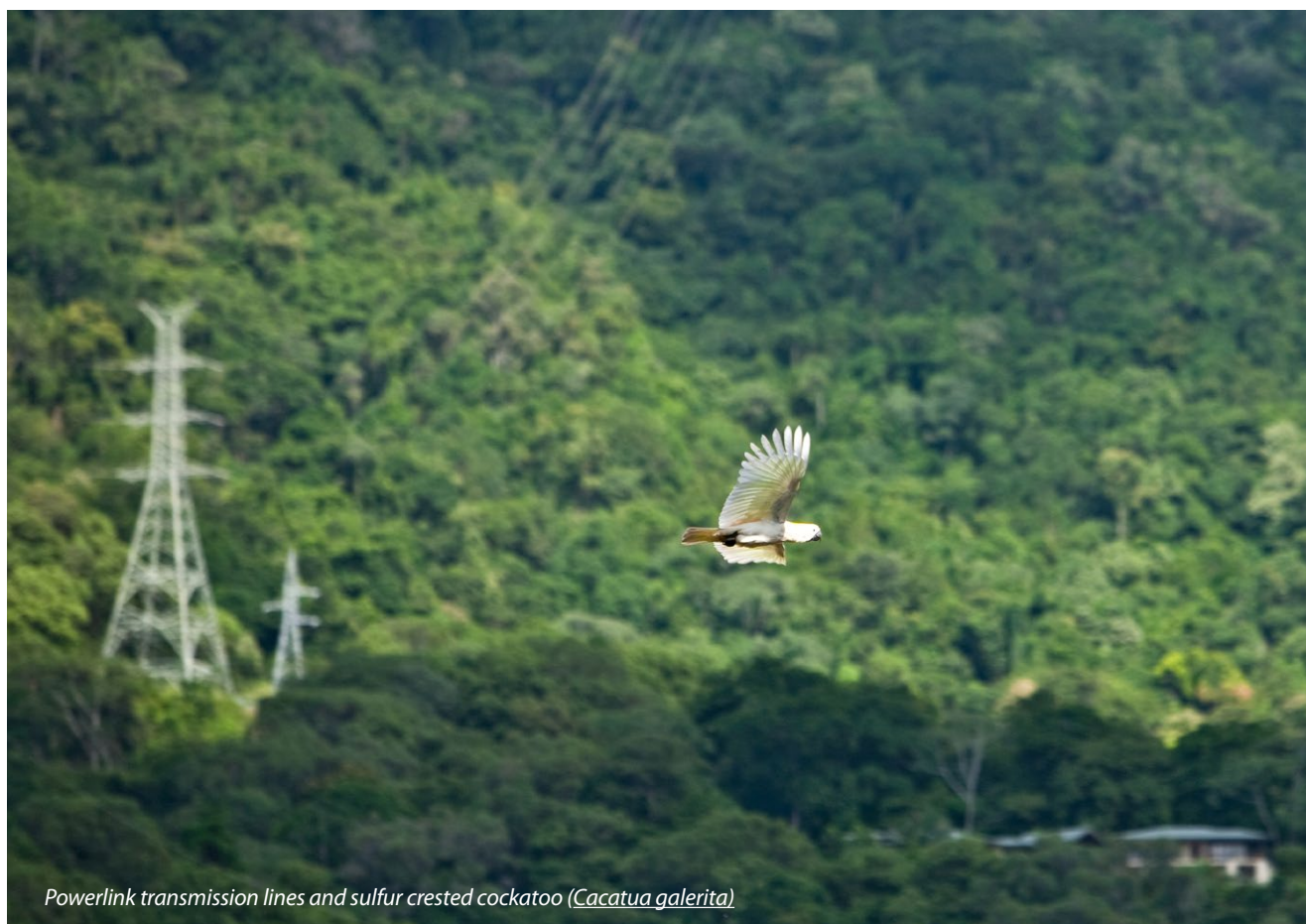
Powerlink transmission lines and sulfur crested cockatoo ( Cacatua galerita )