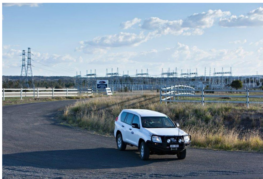
Powerlink's Wandoan Substation, Surat Basin, Qld

To ensure the safety of people and the transmission network, Powerlink restricts certain activities on its easements. A comprehensive guide to activities that are permitted, conditional or prohibited on Powerlink easements can be found at www.powerlink.com.au/co-use-form or call Powerlink.