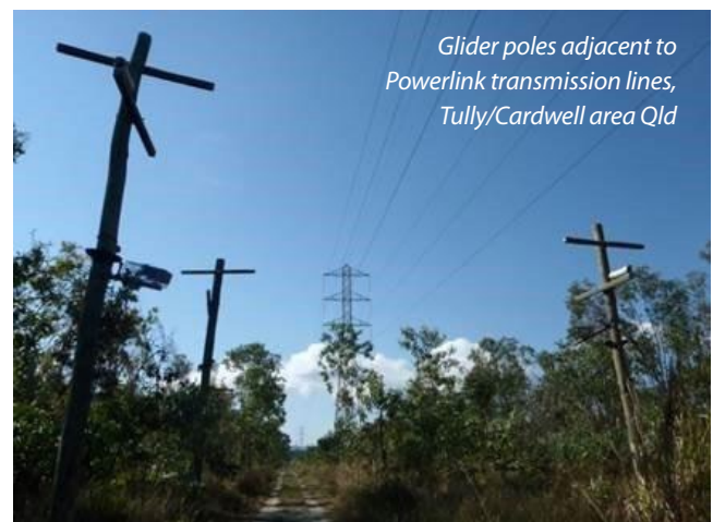
Glider poles adjacent to Powerlink transmission lines, Tully/Cardwell area Qld

Further research and monitoring by UQ has provided guidance for the design, location and installation of glider poles to facilitate glider movement across easements after power transmission line upgrades.