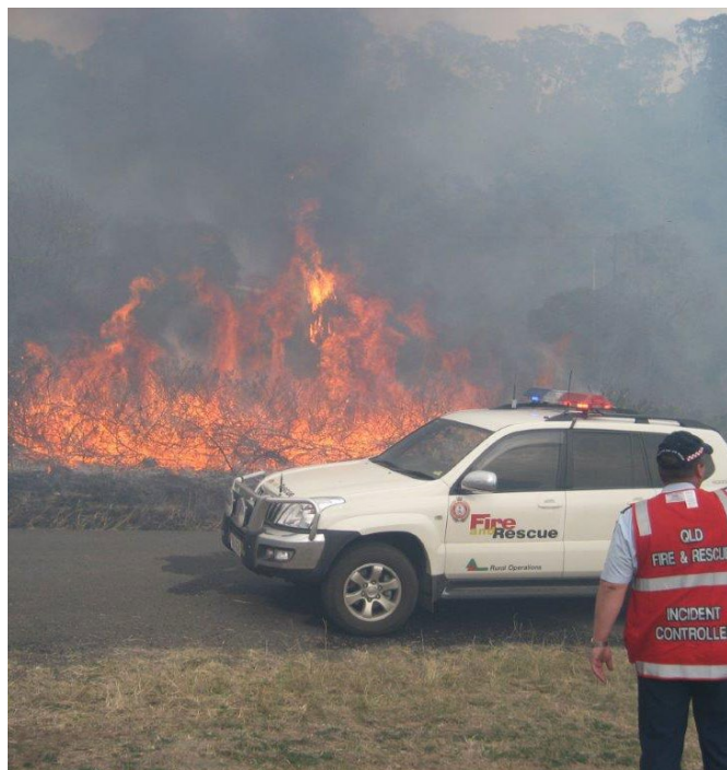
Burnt out powerline on the Toowoomba Range, Qld.

The Energy Networks Association 2 , in consultation with emergency services groups across Australia, has produced National Guidelines on Electrical Safety for Emergency Personnel . Powerlink endorses the use of these guidelines. The guidelines provide critical information relating specifically to fire control near high voltage powerlines, including the special conditions that apply to the use of water in fire control activities near powerlines. An extract from the National Guidelines on Electrical Safety for Emergency Personnel follows. A full version of the guidelines can be purchased from www.saiglobal.com or by calling 131242. If you are involved in fire management or control near high voltage powerlines, please familiarise yourself with these guidelines and the recommended control measures.