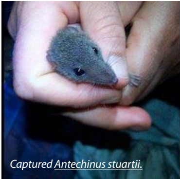
Captured Antechinus stuartii .

Stevens (2007) sought to quantify the barrier effect posed to small mammals by powerline easements in NSW. The study involved the mark-recapture of ground mammals at four sites over a two-year period. Results demonstrated the barrier effect recording a low rate of easement crossing by two common small mammal species, Rattus fuscipes and Antechinus stuartii , even where vegetation in the linear opening had grown tall and dense or where linkages were constructed across the easement. When translocated, more than half of the animals returned to their original side of the easement proving that they can and will cross the easement if they have to.