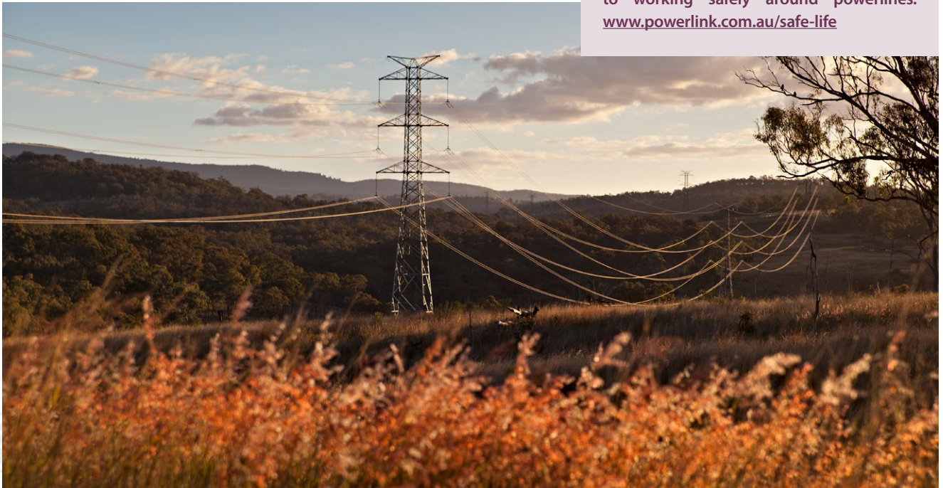
Powerlink transmission lines

Queensland's high voltage electricity transmission network is owned, developed, operated and maintained by Powerlink Queensland, a State Government Owned Corporation. Powerlink's network extends 1,700 km north of Cairns to the New South Wales border, comprising more than 15,000 circuit kilometres of transmission lines. Powerlink's transmission network is the central link in the electricity supply chain, transporting electricity generated at major power stations through its transmission network to the distribution networks owned by Energex and Ergon Energy (part of the Energy Queensland Group) and Essential Energy (in northern New South Wales).