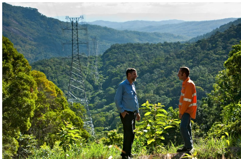
Powerlink transmission lines.

Powerlink maintains the transmission network in a variety of ways, including focusing on the control of any incompatible vegetation by selectively applying approved herbicides and/or removal of these species. If vegetation is identified beyond the easement boundary that is considered a risk, management options will be discussed with the landholder.