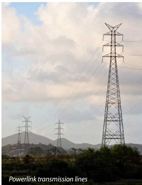
Powerlink transmission lines

Flashovers are potentially life threatening to persons standing in the vicinity of the flashover (much like when lightning strikes the ground). Flashovers can also cause damage to nearby equipment and the transmission line and can cause possible interruptions to power supply to homes.