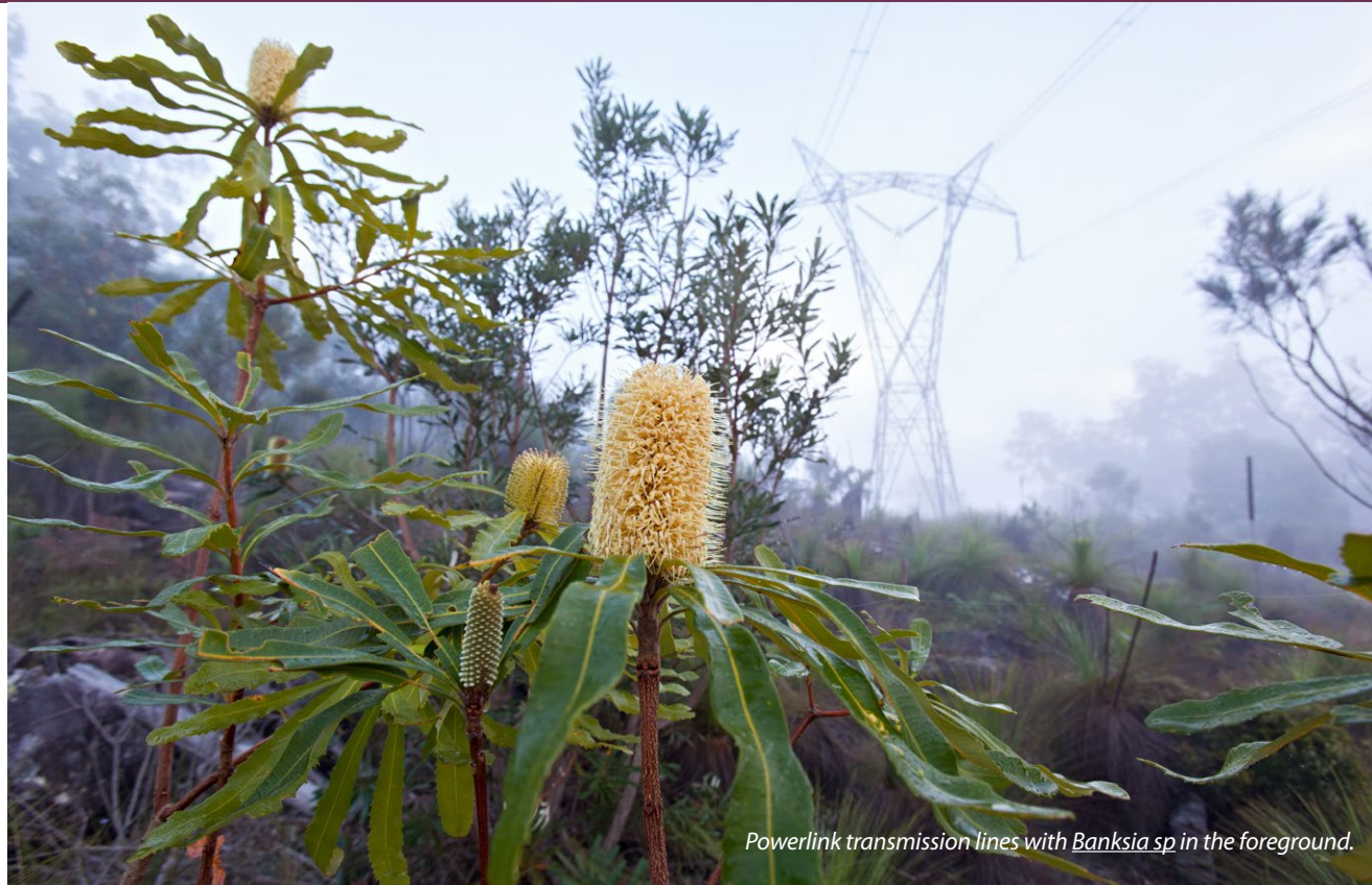
Powerlink transmission lines with Banksia sp in the foreground.

Management of vegetation and access tracks within, and adjacent to, powerline easements are essential for the safe and reliable operation of the transmission network. Vegetation management within powerline easements is collectively referred to as land maintenance. Powerlink has established standards and routine maintenance cycles to ensure safe, reliable and cost-effective outcomes are achieved. Prescribed burning on easements is not part of Powerlink's land management program. However, Powerlink works with landholders to mitigate fire risk through effective fire management planning (including fuel load assessments) and engagement activities with key stakeholders.