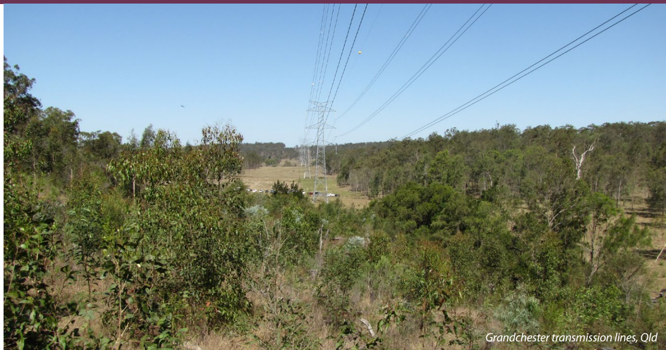
Grandchester transmission lines, Qld

The purpose of powerline easements is to control activities near a transmission line to ensure public safety and the security of electricity supply. An easement provides Powerlink with a legal 'right of way' over a portion of land. Powerline easements are registered on the title of affected land, but ownership of the land remains with the landholder. This means the landholder may use the land for many purposes, provided it doesn't compromise safety or conflict with easement terms and conditions. Where fire control activities (i.e. hazard reduction) are still considered necessary from within the easement, early advice to Powerlink will allow an assessment of risks associated with conducting the burn (contact details below). This advice may result in adjustments to the planned burn. Regardless of the outcome, transmission lines should be considered live at all times.