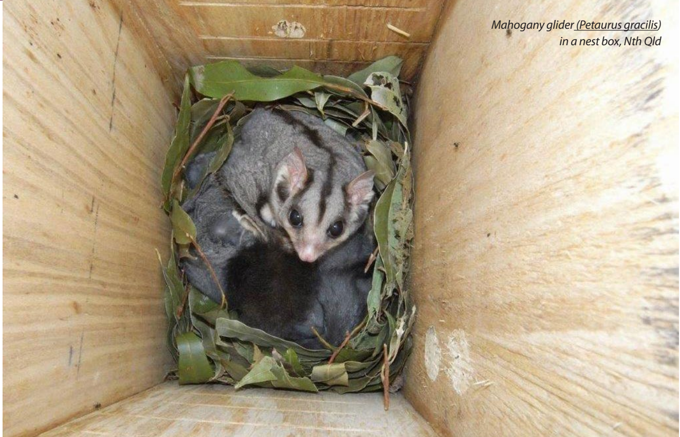
Mahogany glider (Petaurus gracilis) in a nest box, Nth Qld

Whilst powerline easements are necessary to enable the delivery of essential services to the community, there is a need to understand how these easements function with respect to flora and fauna (Stevens 2007). For instance, while the area of habitat replaced by powerline easements may not be great, the total area of habitat likely to be affected can be extensive due to the combined barrier and edge effects between the easement and natural vegetation (e.g. weed invasion, exposure to predators, loss of ground cover). There is a growing body of research that seeks to better understand these impacts, some of these studies are described below.