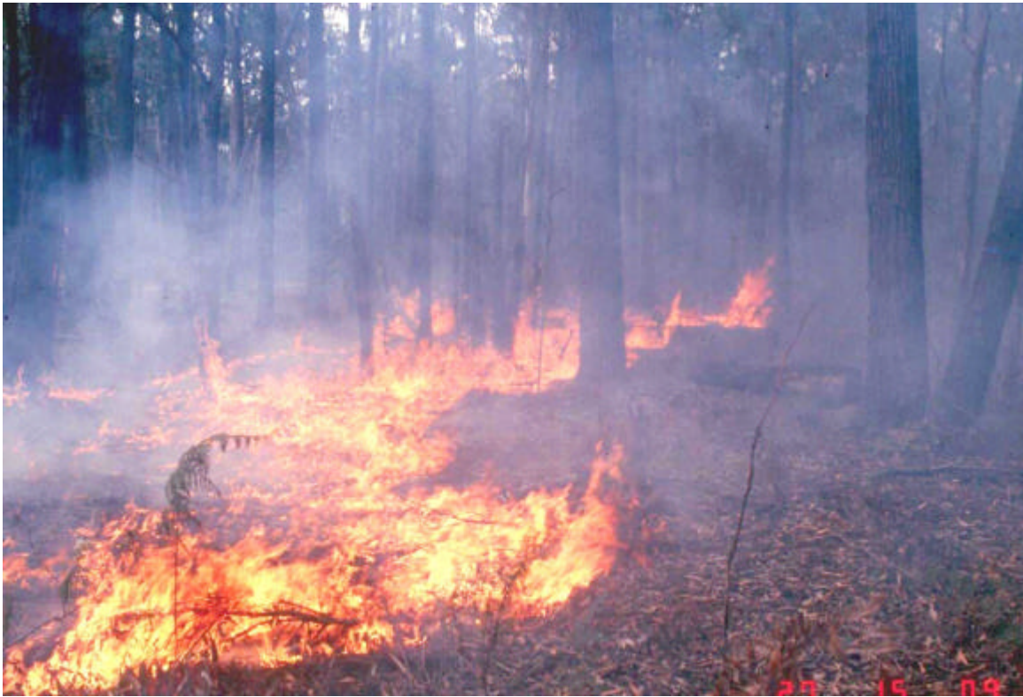
Figure 6 A typical headfire produced by prescribed burning. With drier profile FMCs, higher flame heights and reduced flame angles will increase the consumption of fine fuels.