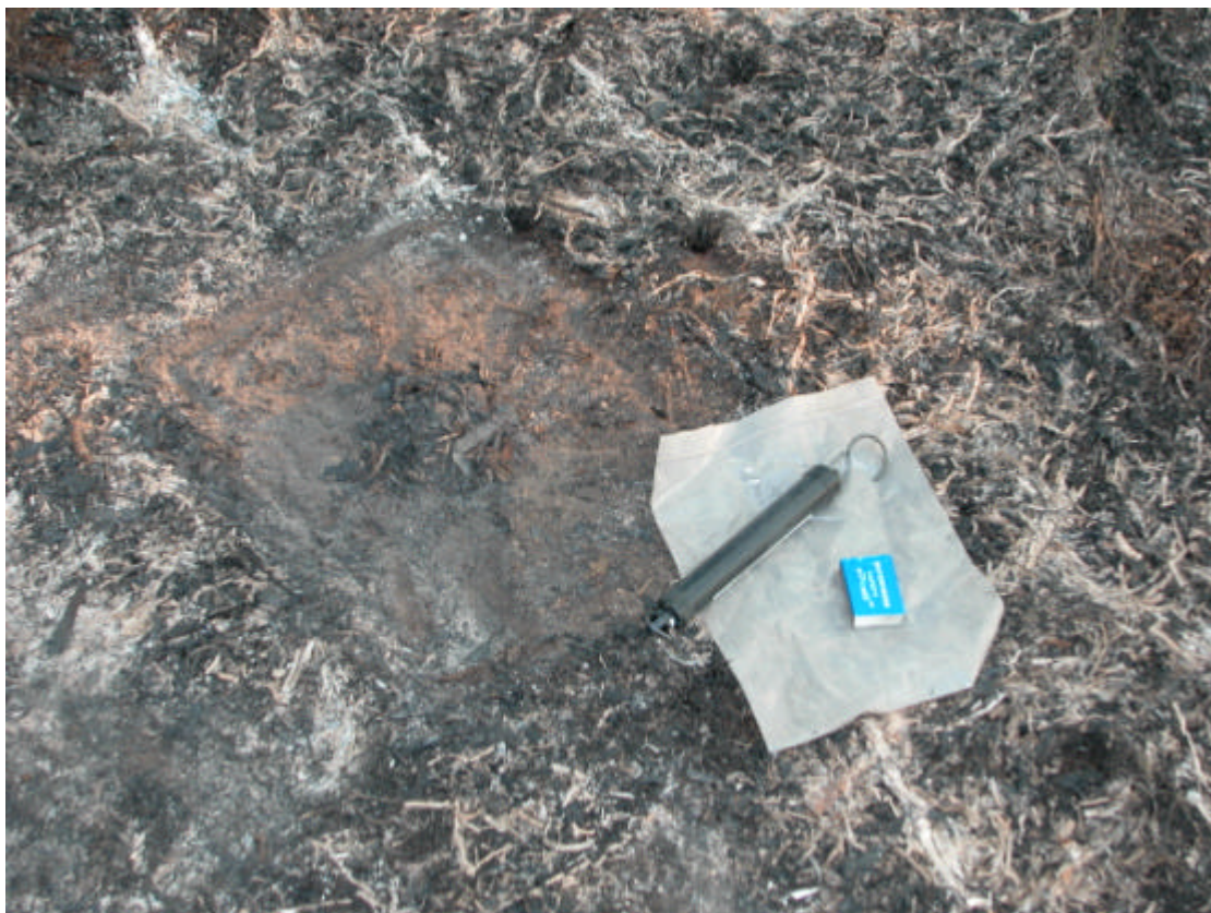
Figure 5 Fuel quantity resampling after fire has burnt through test area. All material which has not burnt to ash is gathered and weighed. Care taken not to collect dirt or stones.

Following the passage of the fire through the sampled area, fuel resampling was carried out on five 0.085 sq m sample areas. These were located as close as possible, but not directly on, the areas which were sampled prior to burning. The material collected included all leaf, twig and bark material less than 6 mm thickness which had not been completely consumed by the fire. This material included some ash, but was mostly charcoaled (i.e. partially burnt) fragments and any completely unburnt material. The intention was to collect any material which either had not been burnt at all, or could possibly have been burnt more completely. A deliberate attempt was made not to include any dirt, stones or pre-existing charcoal fragments when doing this resampling.