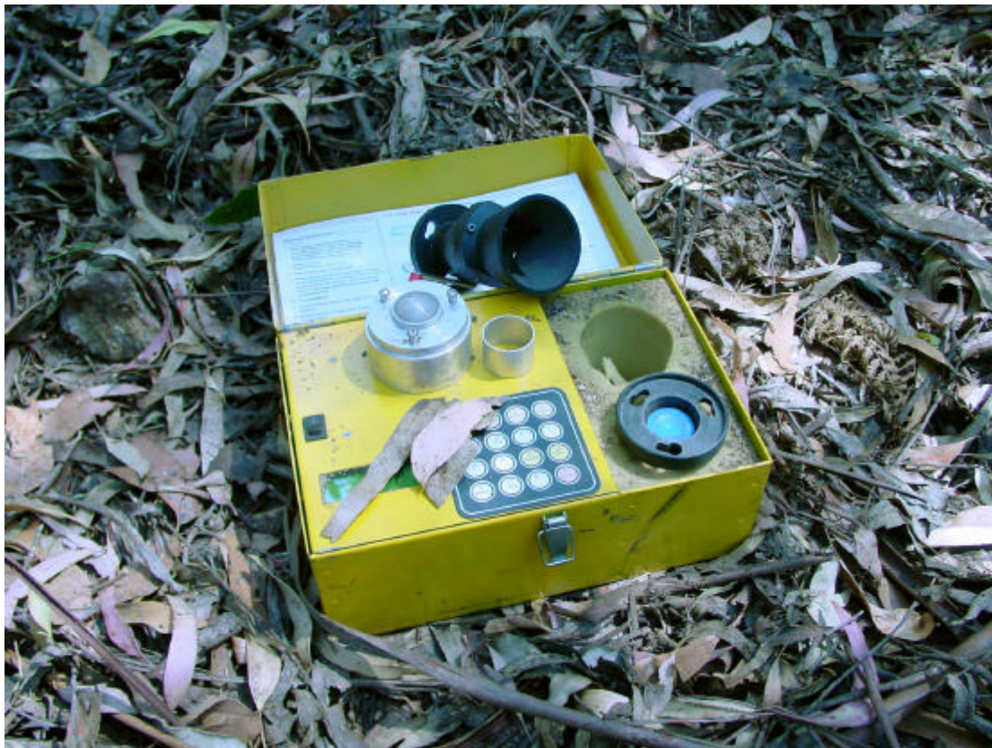
Figure 2 Wiltronics TH Fine Fuel Moisture Meter (prototype model shown) used for fuel moisture sampling.

The Wiltronics TH Fine Fuel Moisture Meter (Chatto and Tolhurst 1997) was used to sample fine fuel moisture contents. At each sampling area, three samples of fine fuel moisture content were taken at both the top and bottom of the litter bed.