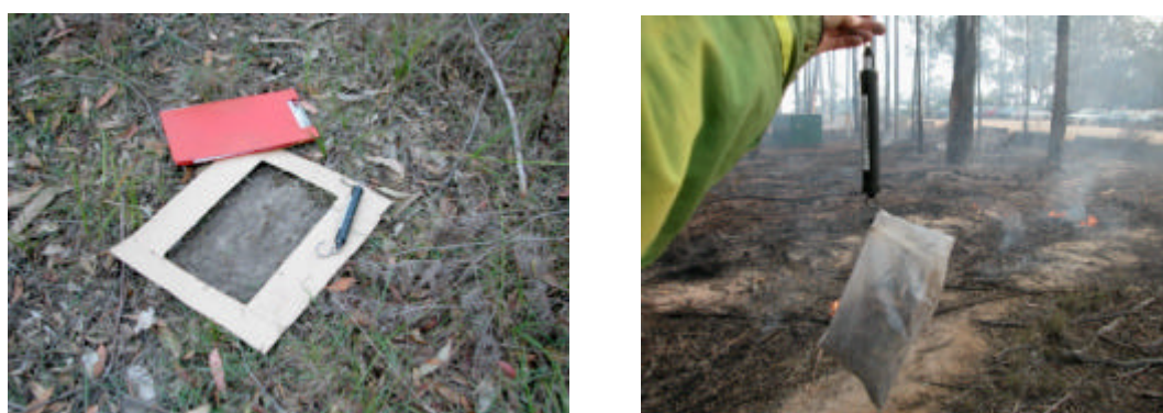
Figure 1 Fuel quantity sampling showing litter fuel collected from 0.085 m 2 sample plot. Fuel is then weighed with spring balance.

A deliberate attempt was made to sample sites which had mostly litter and bark fuels only, as it was thought that the presence of substantial shrub fuels would only produce further unnecessary variation in both fuel moisture contents and fire behaviour outcomes.